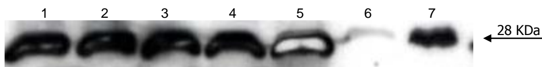
Fig. 1 Immunoblot of brain homogenate of various species with the monoclonal antibody CB 38 1: Mouse; 2: Rat; 3: Guinea pig; 4: Rabbit; 5: Macaca fascicularis; 6: Zebrafish; 7: chicken. In all species, only a band at 28 kDa is detected.