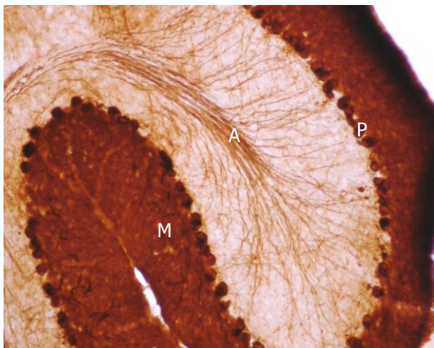
Fig 2a: Immunohistochemical staining with CB 38 in the cerebellum of a control mouse. Notice the strong staining of the Purkinje cell bodies (P), their dendrites in the molecular layer (M) and their converging axons (A). X100